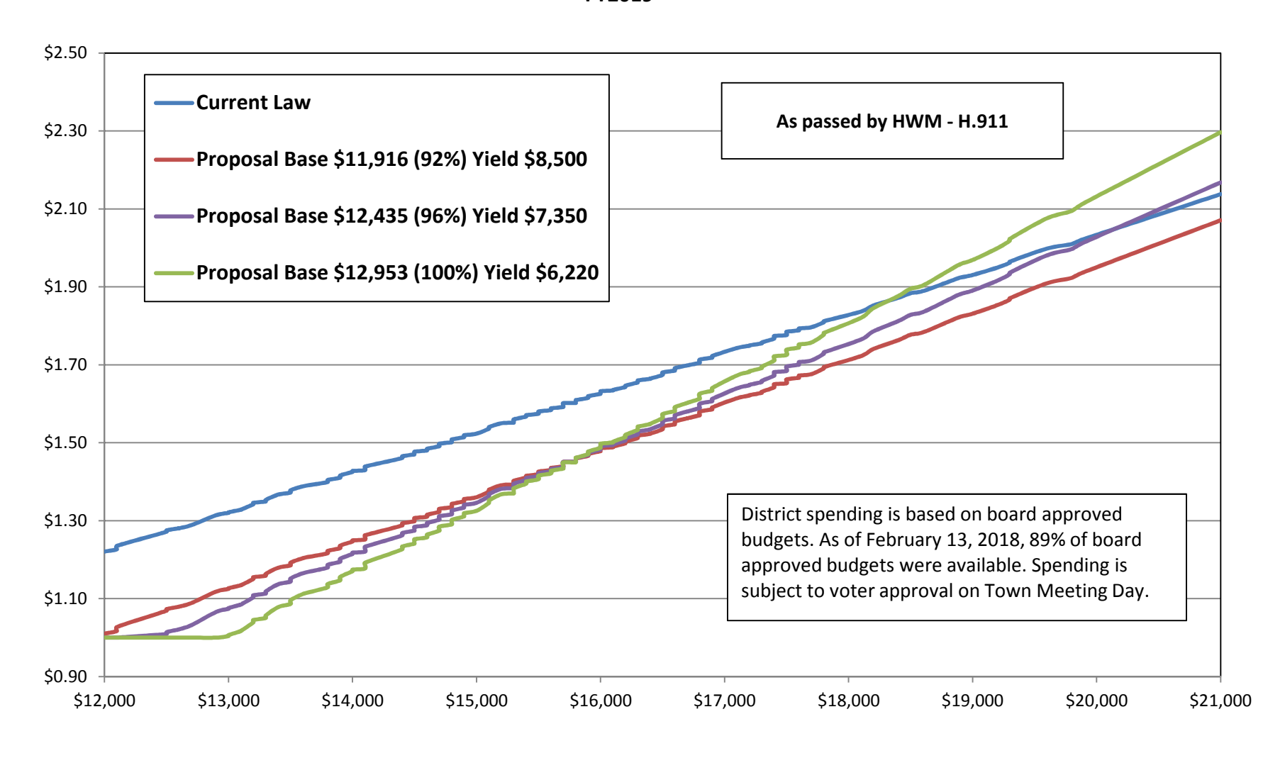
Education Spending Per Equalized Pupil